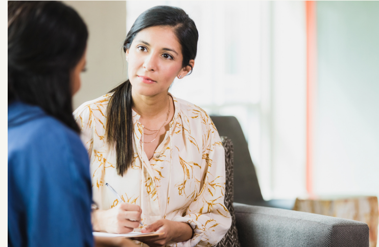
PSYCHOTHERAPY & COUNCELLING