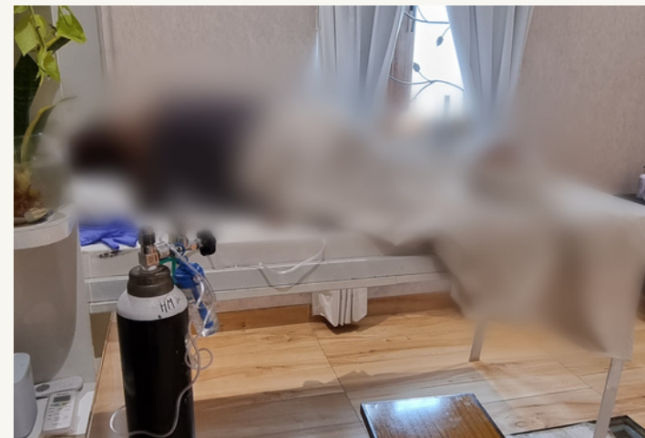
OXYGEN & OZONE THERAPY