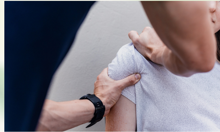
PHYSIOTHERAPY ACUPRESSURE & ACUPUNCTURE