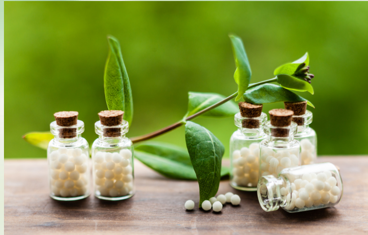
HOMEOPATHY & BACH FLOWER