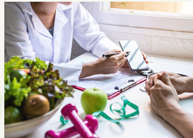
CLINICAL & THERAPEUTIC NUTRITION