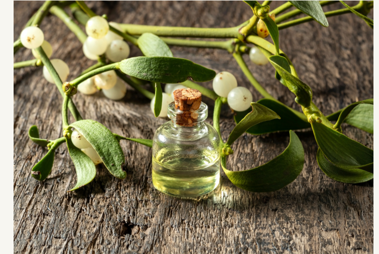
ANTHROPOSOPHIC MEDICINE / MISTLETOE THERAPY